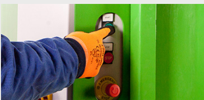
IP56 control panel for easy operation