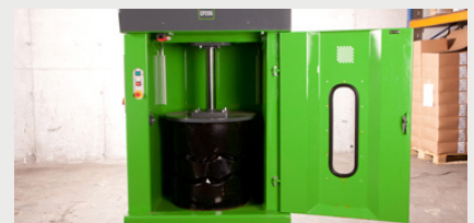
Crush drums to a fraction of their size