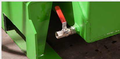
40-litre liquid retention tank with outlet tap