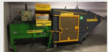
Bin Size can be adapted to site requirement