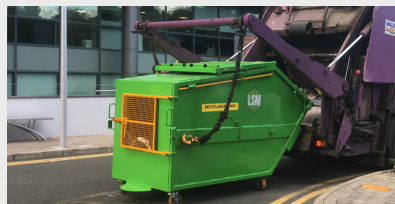
Materials emptying from closed bin into REL truck